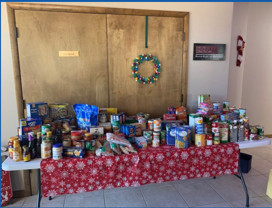
Food donations collected for the Old Town Mission

Before Thanksgiving we hosted a food drive and collected food for the Old Town Mission in Cottonwood, Arizona.