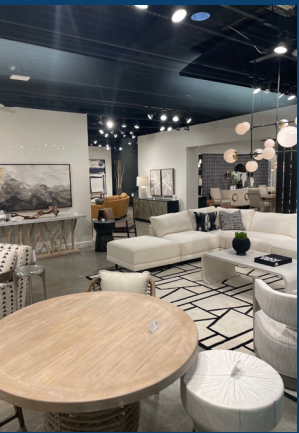
Hooker Furnishings showroom

On the Hooker Furnishings project site, we had over 30 workers waiting to be released when the inspector arrived, and within hours of receiving the thumbs up, the drywall was installed, and the tapers were floating away with 45 minute hot mud. Turnover took place early Sunday morning while our carpenters were installing wood base and the retailer was merchandising the space.