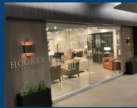
Hooker Furnishings exterior

Although SMC only built seven of the 40+ projects for this market cycle, we look forward to expending our resources for this coming summer market as well as meeting on-site at the IMC property in Atlanta, Georgia, this February and exploring the idea of testing the waters in Atlanta at some point in 2022. IMC's locations in Atlanta and High Point, North Carolina, are both over 7 million square feet and can provide many opportunities for SMC for years to come.