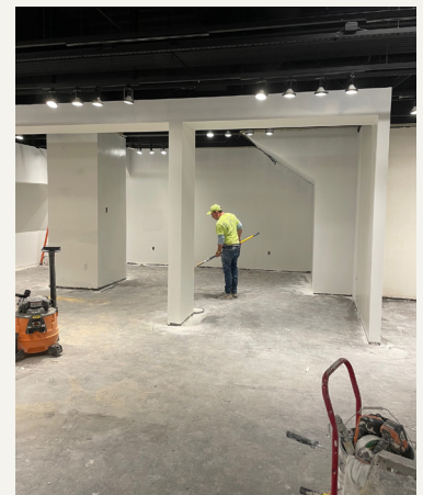
Hooker Furnishings painting