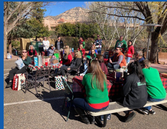
White elephant gift opening