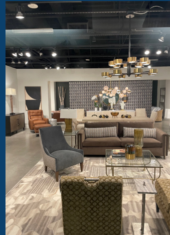
Hooker Furnishings showroom