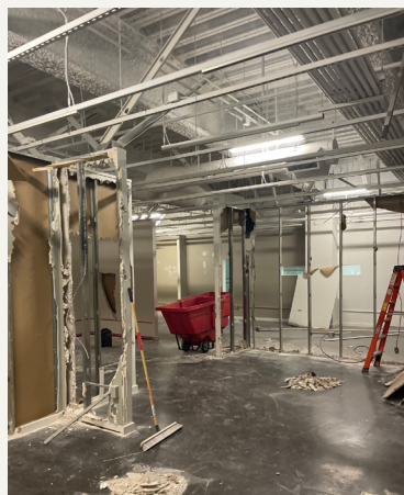
Hooker Furnishings demolition