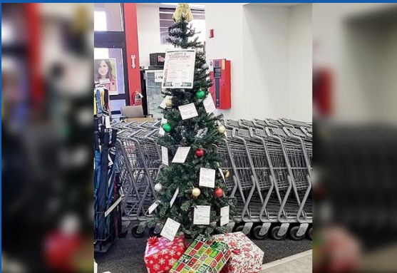
Angels Care Home Health Adopt-A-Grandparent tree

For Christmas this year we donated to the Adopt-a-Grandparent program. We picked four grandparents from the Angels Care Home Health giving tree. The gifts went to two men and two women in Cottonwood. Beanies, warm blankets, gloves, and large print crossword puzzles were top hits. This is the eighth year of the program and one we