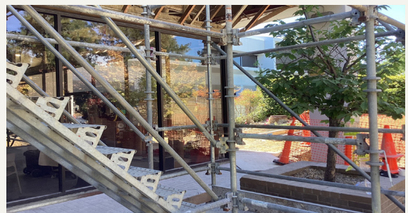
Start of the staircase from the café to the deck