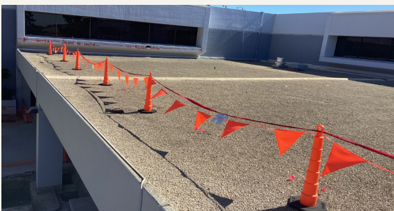
The future amenity deck