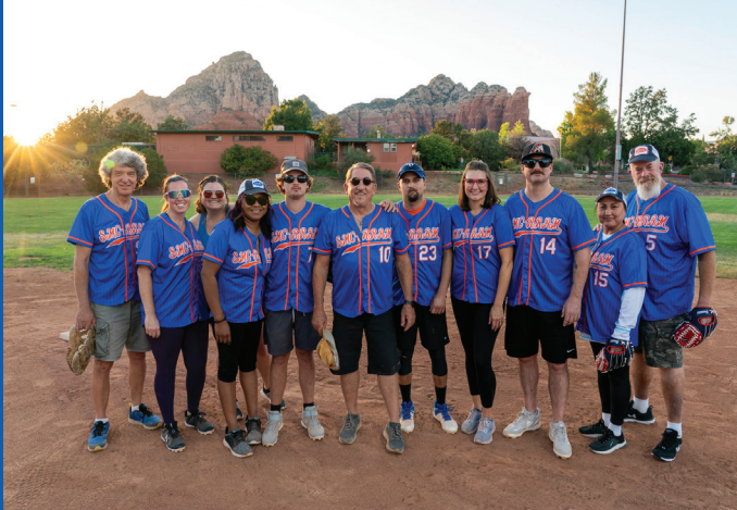
Most of the SMC RRAMs team!