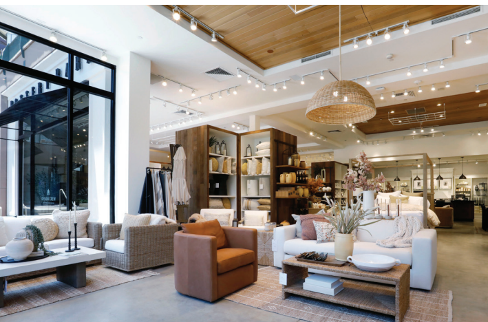
POTTERY BARN El Paso, TX