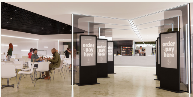
Rendering of the finished café

Construction has just begun and we look forward to providing an update on the project in our next newsletter issue!