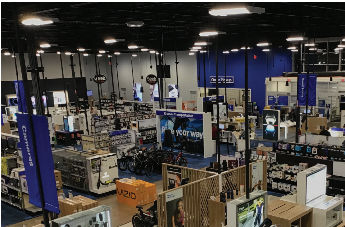
BEST BUY Henderson, NV