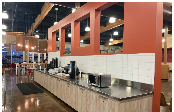
CSUEB PIONEER DINING HALL Hayward, CA