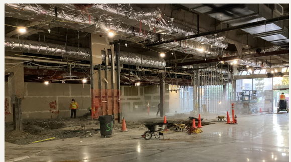
Beginning stages of the café