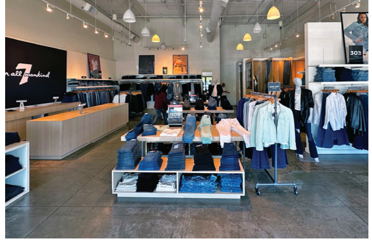
7 FOR ALL MANKIND Commerce, CA