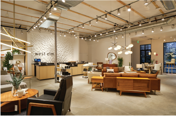
WEST ELM Campbell, CA

Recently completed projects from around the country.