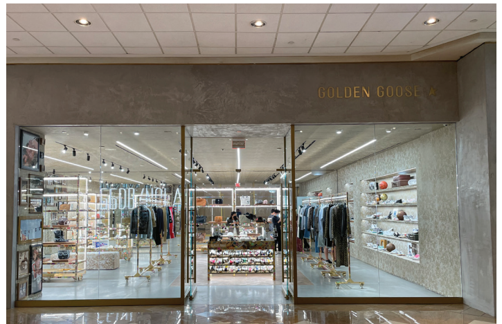
GOLDEN GOOSE New Orleans, LA